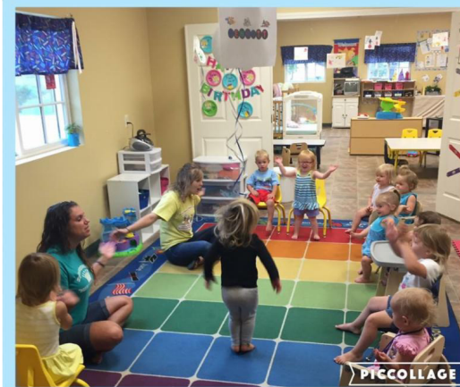
Infant and toddlers at Kids Palace learning time. Reviewing numbers_ shapes_ days of the week and more each morning_

If you're happy and you know it clap your hands 🎵